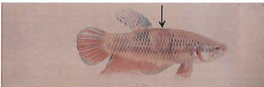
Fig. 4 A large white spot with generalized pallor produced by an injection of 50 ul urine sample intramuscularly. (A patient with bilateral adrenal pheochromocytoma)