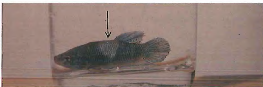
Fig. 3 A large white spot produced by an injection of 50 ul urine sample intermuscularly. (A patient with neuroblastoma)