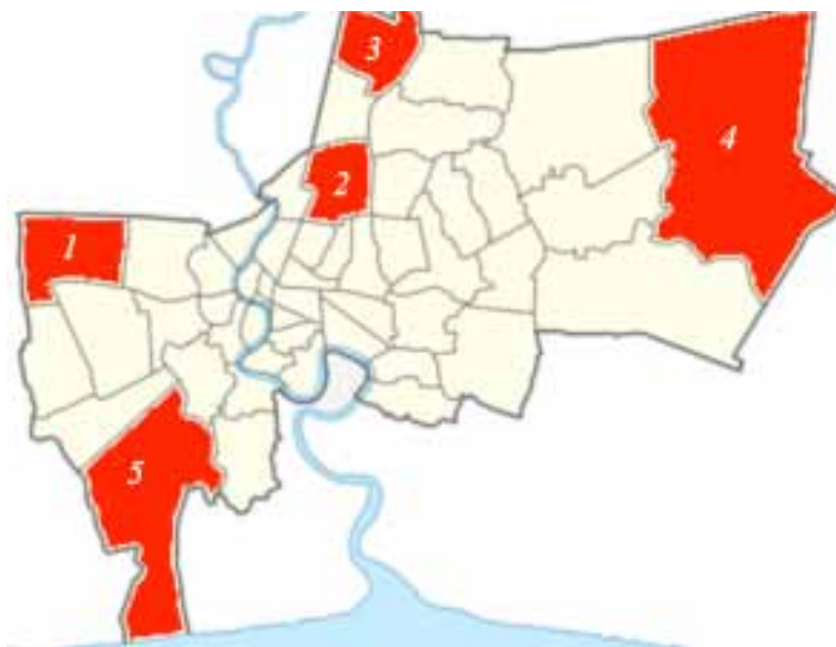
Fig 1 Study locations in 5 districts at the periphery of Bangkok Metropolitan area, in the North, South, West, and East (Assigned as 1-5: 1= Thawi Watthana, 2= Phaya Thai, 3= Don Mueang, 4= Nong Chok, 5= Bang Khun Thian)

Of the 50 districts of the Bangkok Metropolitan area (Figure 1), we selected the five districts containing the biggest markets for purchasing