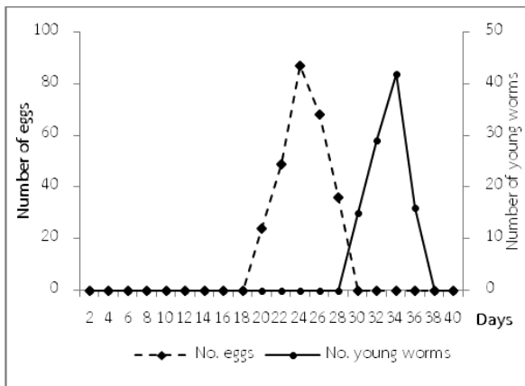
Figure 1. Period between egg laying and hatching of L. hoffmeisteri in the laboratory culture.

Since the wall of L. hoffmeisteri cocoons had been stuck to fine particles after laying, therefore cocoons individual were observed inside the mature specimens (Figure 2).