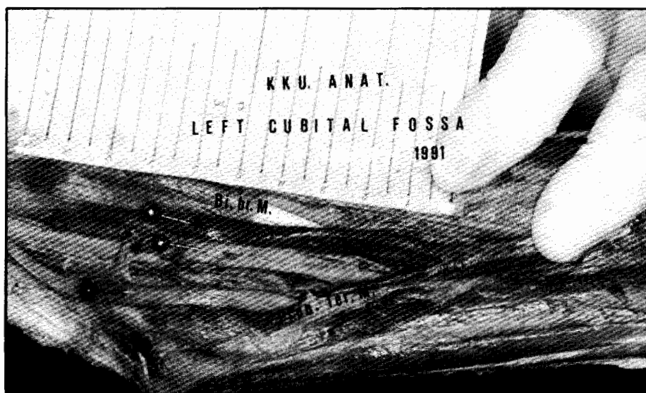
Left cubital fossa, dissected

The proposed name for this muscle, Brachio-pronatus, is based on the standard nomenclature. It was found to originate from the medial intermuscular septum in a form of a fibromuscular ribbon about one centimeter wide. It joined the tendon of the pronator teres muscle to the lateral side of the shaft of the radius about its midlength. Its belly is comparable to the size and shape of the pencil, about 13 centimeters long. We dissected out a branch from the median nerve entering the muscle just proximal to the superior boundary of the antecubital fossa. Its arterial supply is from the adjacent brachial artery. Its fascia is characteristically investing the muscle. See the figure below