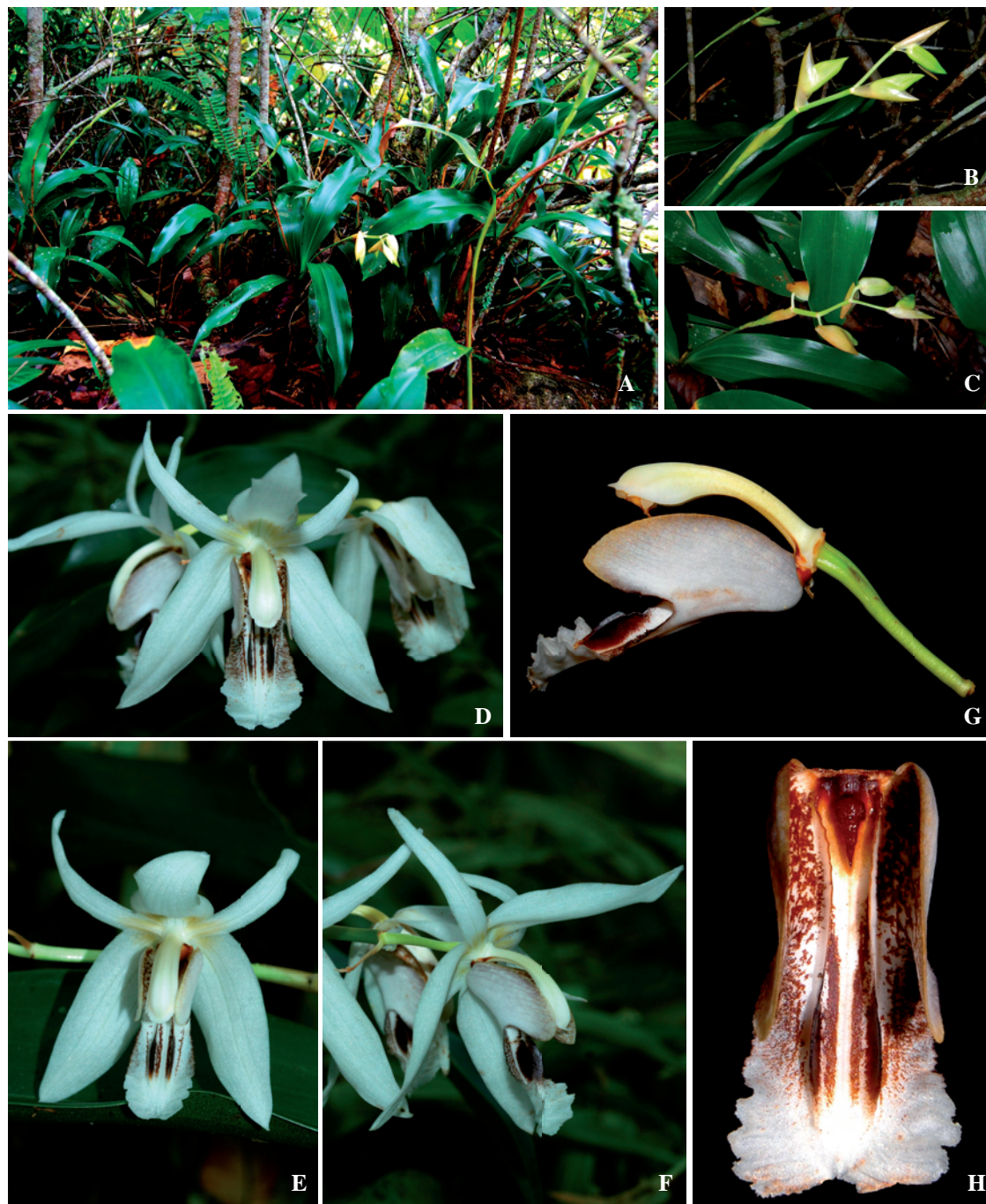
Figure 2. Coelogyne puhinrongklaensis Ngerns. & P. Tippayasri: A. habit; B–C. inflorescence with flower buds and floral bracts; D–E. flower (front view); F. flower (side view); G. Lateral view of flower, sepals and petals removed; H. lip.