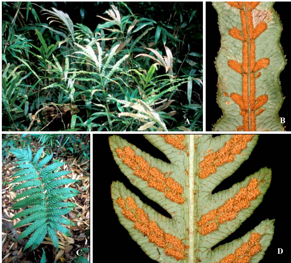
Figure 2. Woodwardia harlandii Hook.: A. habit; B. part of fertile pinnae; Woodwardia japonica (L.f.) Sm.; C. habit; D. part of fertile pinnae. Photographed by S. Suddee and S. Samransuk, Phu Luang, Loei.

Rhizome short, erect, covered with large red-brown scales at bases. Stipe 25–50 cm long, scaly at base; scale large, reddish-brown, lanceolate, entire. Fron d large, monomorphic, 1-pinnate-pinnatifid; lamina oblong-lanceolate, 50–90 by 28–40 cm, truncate to rounded at base, acute to acuminate at apex; pinnae oblong-lanceolate, sessile, base truncate, lateral pinnae 7–20 pairs, lobed about \frac{3}{4} way to costa, segments on either side of costa of equal length; median pinnae 14–20 by 2–6 cm. Sori oblong, in 2 rows along costules, 2–4 mm long, sunken; indusia discrete, membranous, brown, opening towards costa and costules.