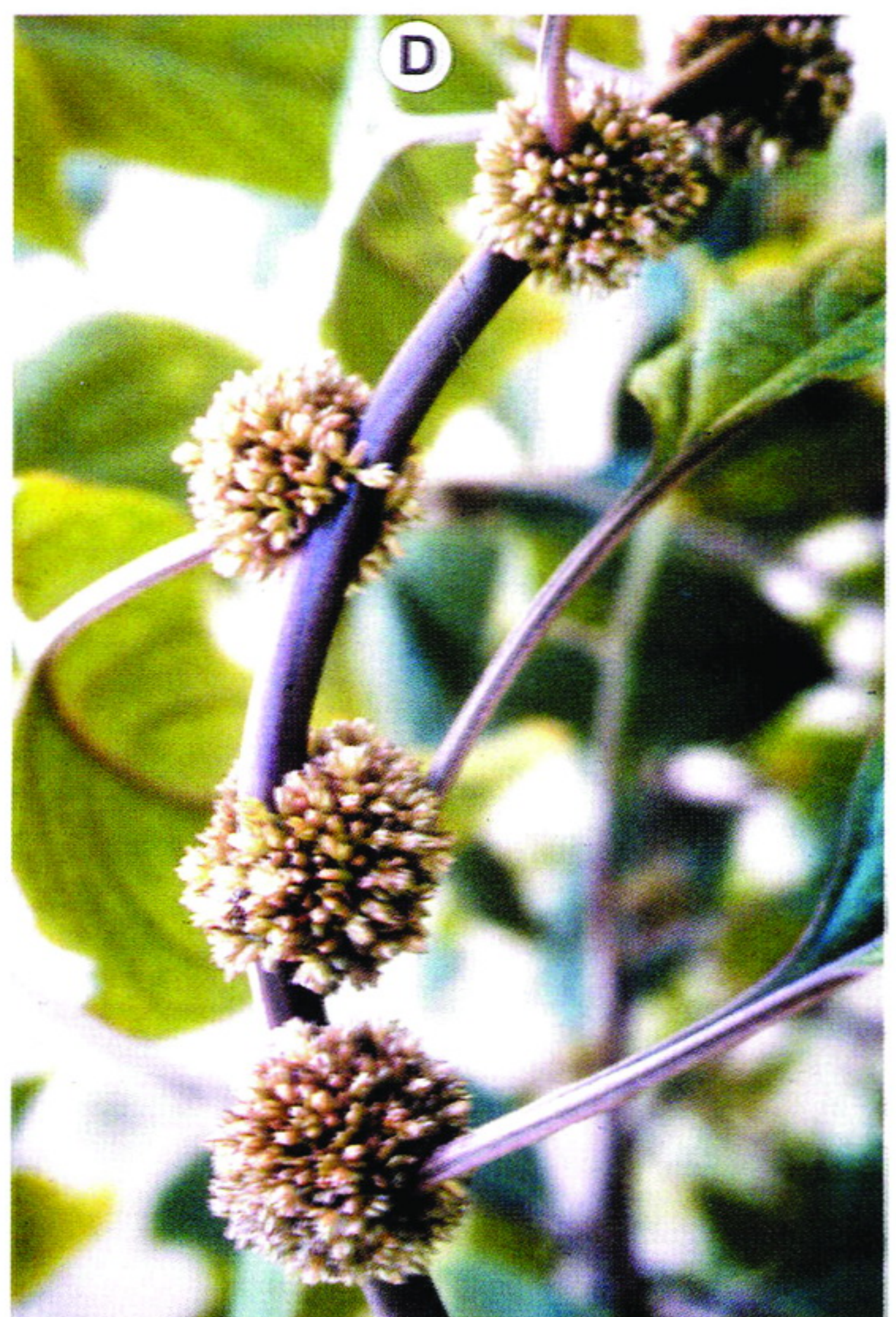
Figure 1. Siamosia thailandica A-B. Plants from natural habitat at Kaeng Kra Chan, Larsen et al. 45440; C-D. Plants from the greenhouse at AAU grown from seeds from the Kaeng Kra Chan population.