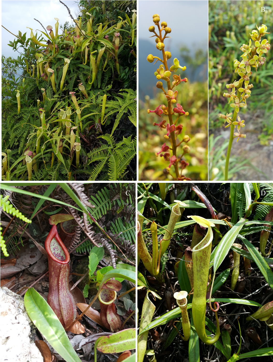
Figure 3. Nepenthes krabiensis . A. habitat and habit, B. male inflorescence (left) and female inflorescence (right), C. lower pitcher; D. upper pitcher.