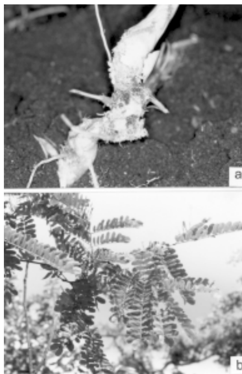
Figure 3 Host plant of Sternocera ruficornis .

Adults were found feeding on leaves of terminal branches. There were eleven host plants in the Dry Dipterocarp Forest (Table 3), representing 11 species from 6 families which is similar to the report by Viravaidya and Annes (1994). Hutacharearn and Tubtim (1995) suggested that S. ruficornis was