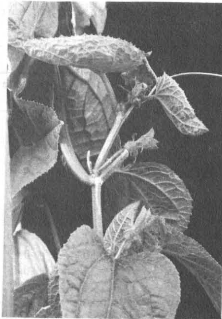
Figure 2 Lateral shoot developed on the plant whose main shoot was pinched in cucumber cv. 'Sagami-hangiro'. Note that the lateral shoot was formed.