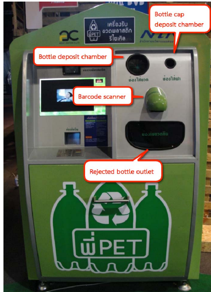
Figure 1. P'PET RVM