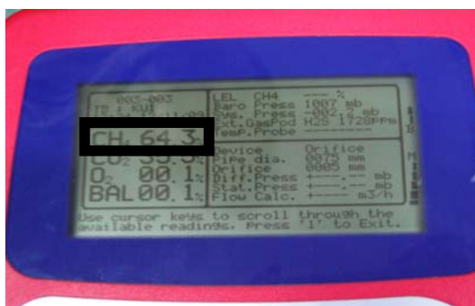
Figure 3 Measurement of methane production by biogas meter.

Note: Day 1 means Day 23 in the fermentation system