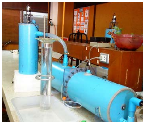
Figure 2 Two phase fermentation tank