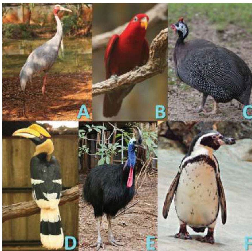
Figure 1 Example of captive birds, in Nakhon Ratchasima Zoo, which were included in this study;

A: Eastern sarus crane ( Antigone antigone ), B: Eclectus parrot ( Eclectus roratus ), C: Guinea fowl ( Numida meleagris ), D: Great hornbill ( Buceros bicornis ), E: Cassowary ( Casuarius casuarius ) and F: Humboldt penguin ( Spheniscus humboldti )