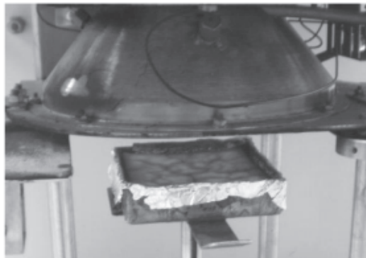
Figure 3 Specimens were wrapped in a thin aluminium foil (except the upper surface).

All wood specimens were prepared with approximately the same size : 10 cm x 10 cm. Dimensions including width, length, and thickness of all specimens were precisely measured by a digital vernier sliding caliper. The mass of the specimen was measured by the load cell of the Cone Calorimeter. Then the density of each specimen was calculated. Specimens were wrapped in a thin aluminium foil (except the upper surface) for one dimensional heat conduction (see in Figure 3).