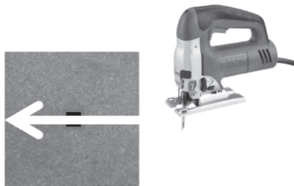
Figure 4 A specimen was sawed along the direction shown by the arrow into two similar pieces. A black square was the measuring position.

After the heat exposure was completed, the exposed specimen was sawed into two similar pieces to measure the char depth at the center point of the specimens (see in Figure 4). The char depth was the distance measured between the original upper surface and the lowest char layer (Just and Tera, 2010) (see in Figure 5). For the char depth measuring, each piece of specimens was measured 3 times and the obtained values were used for calculating the mean and standard deviation of the char depth.