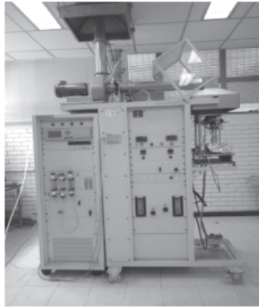
Figure 2 The Cone Calorimeter at the Fire Safety Research Unit at Chulalongkorn University.

The tests were carried out by using the Cone Calorimeter equipment available at the Fire Safety Research Unit of Chulalongkorn University (see in Figure 2).