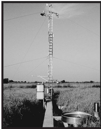
(a) paddy field